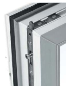
Visual Lock & Shoot Bolt